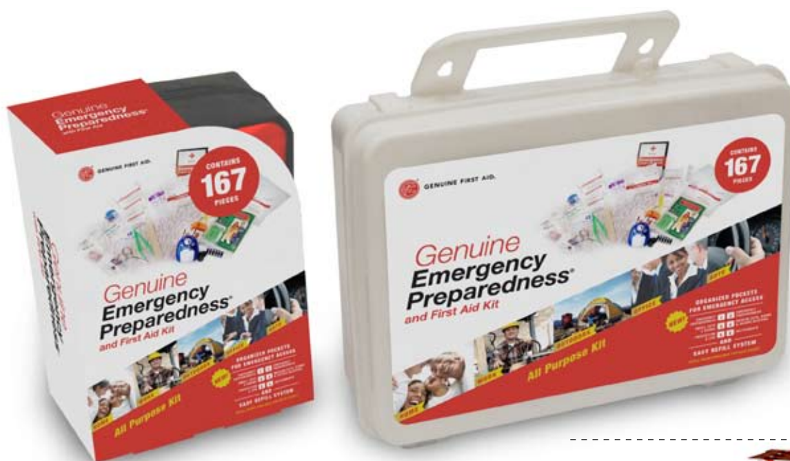
RETAIL DISPLAY BOXES INCLUDED IN CASE

Genuine Emergency Preparedness Kits are available in either a soft bag or a hard case. The hard case is wall-mount ready and ideal for use in office and industry settings where kits are required to be visibly available.